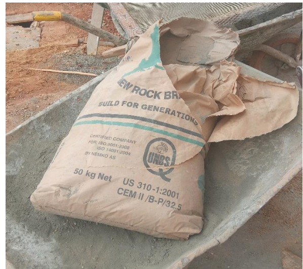
Ordinary Portland Cement.