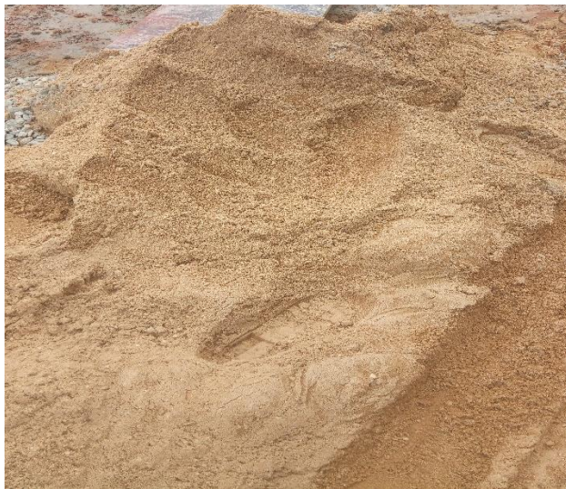
Lake sand sample.