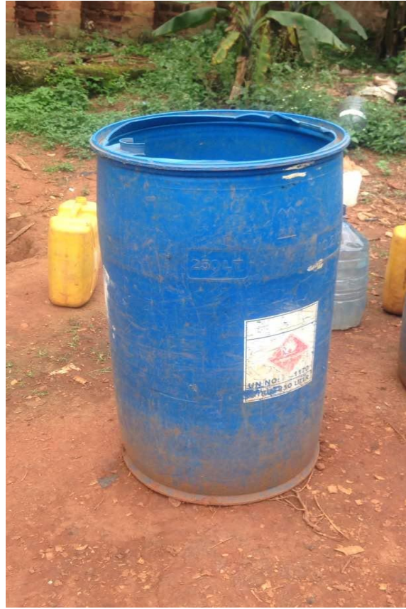
Hard, Machine crushed, Half inch aggregate stone. Water Tank/drum sample, Pvc, 250L.